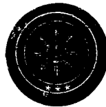
FERDINAND ROMUALDEZ MARCOS JR. President of the Philippines