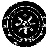
FERDINAND ROMUALDEZ MARCOS JR. President of the Philippines